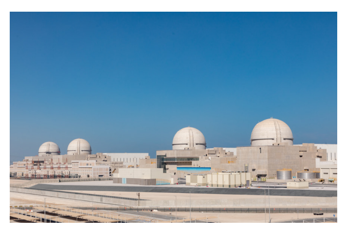
The Barakah Nuclear Energy Plant is currently delivering 2,800 megawatts of clean and reliable electricity to the UAE grid.

The UAE is also the first country in the Middle East to operate zero carbon nuclear power, which, along with renewable energy, will provide 14GW of clean power for the UAE by 2030.