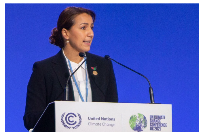
The UAE is working with the international community to strengthen global efforts to address climate change.

A leader and key partner in the international effort to address climate change, the UAE will host COP28 in 2023. After being the first Middle Eastern nation to sign the Paris Agreement, the UAE was also the first country in the region to submit its Nationally Determined Contribution (NDC) in 2015. It is one of just 13 countries globally to have submitted its second NDC.