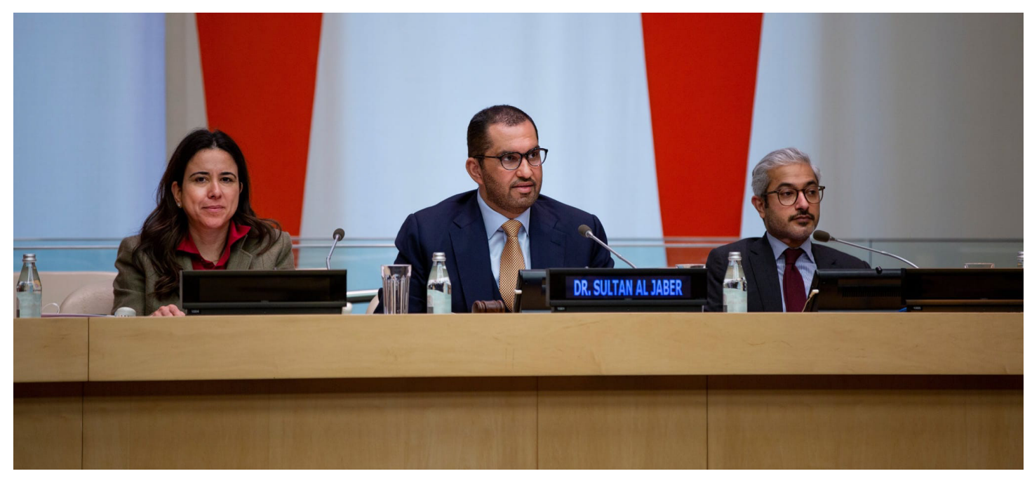
Addressing UNSC members, HE Dr. Sultan Al Jaber underscored the importance of climate finance to enable sustainable progress and stability.

Beyond its multilateral commitments, the UAE supports global sustainable development. To date, the UAE has invested in renewable energy ventures with a total value of $17 billion across the globe, from the UK to India to Uzbekistan. The UAE provides $1 billion of aid for renewables to more than 40 countries, with a special focus on island and least-developed nations.