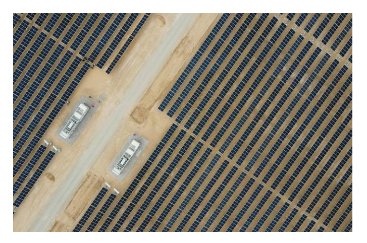
Mohammed bin Rashid Al Maktoum Solar Park in Dubai.