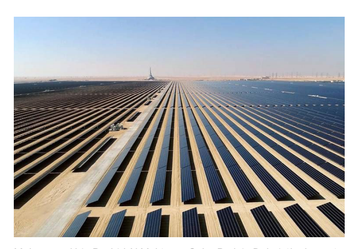
Mohammed bin Rashid Al Maktoum Solar Park in Dubai, the largest single-site solar park in the world based on an Independent Power Producer model.

In a region with extreme heat and scarce natural water and food resources, the UAE is taking aggressive action at home and with partners to meet the global climate challenge. As one of the world's largest energy suppliers and sovereign investors, the UAE is also leading on the energy transition by reducing the carbon impact of hydrocarbons, deploying sustainable and clean technologies, and investing in renewable energy ventures in island and developing nations.