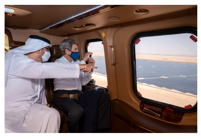
Climate Envoy Kerry visited major strategic projects in the UAE supporting the country's efforts in the field of clean energy, including the Noor Abu Dhabi solar park.

The UAE and US governments are building on many years of strong bilateral ties to tackle global climate change challenges together. The countries' joint efforts will not only accelerate efforts to reach climate goals, but will also enhance economic opportunity and diversification, while creating knowledge, skills and jobs.