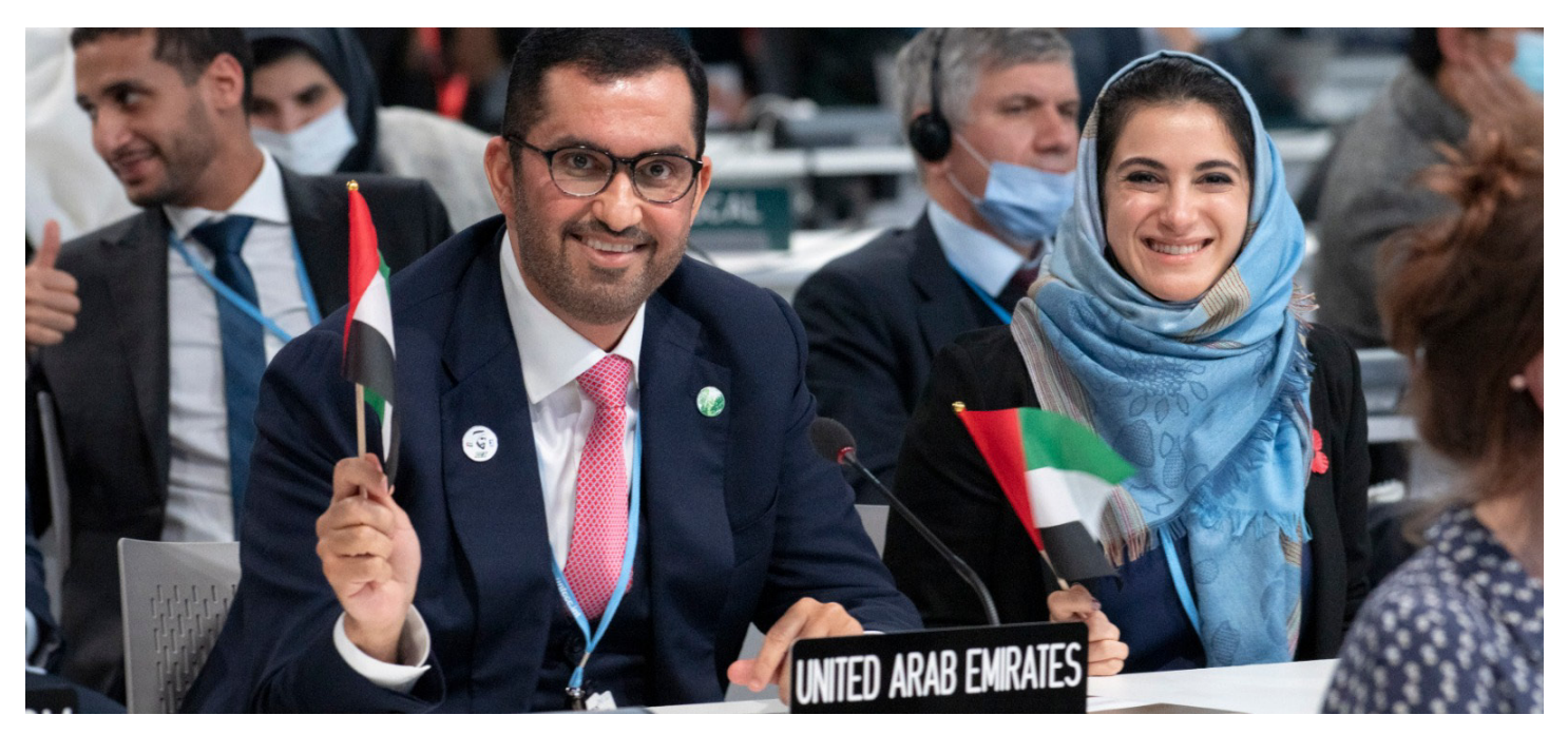
In November 2021, the UNFCCC announced that the UAE will host COP28 in 2023.

The climate emergency is a global challenge that requires a global response. The UAE looks forward to further strengthening cooperation with the US and partners around the world to drive climate action and chart a course for a more sustainable future.