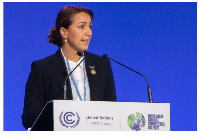
The UAE is working with the international community to strengthen global efforts to address climate change.

A leader and key partner in the international effort to address climate change, the UAE will host COP28 in 2023. After being the first Middle Eastern nation to sign the Paris Agreement, the UAE was also the first country in the region to submit its Nationally Determined Contribution (NDC) in 2015. In September 2022, the UAE updated its second NDC, setting a more ambitious target for curbing carbon emissions 31% by 2030, up from its previous 23.5% target.