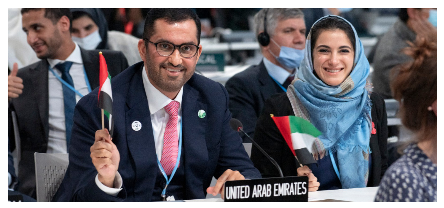
In November 2021, the UNFCCC announced that the UAE will host COP28 in 2023.

The climate emergency is a global challenge that requires a global response. The UAE looks forward to further strengthening cooperation with the US and partners around the world to drive climate action and chart a course for a more sustainable future.