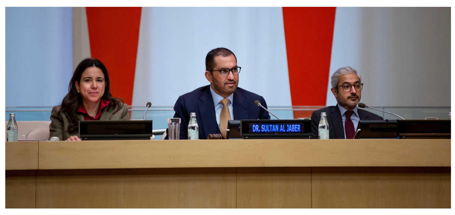
Addressing UNSC members, HE Dr. Sultan Al Jaber underscored the importance of climate finance to enable sustainable progress and stability.

Beyond its multilateral commitments, the UAE supports global sustainable development. The UAE has invested more than $50 billion in renewable energy projects across 70 countries – including 27 island nations – and plans to invest an additional $50 billion over the next decade. The UAE provides $1.5 billion of aid for renewables to more than 40 countries, with a special focus on island and least-developed nations.