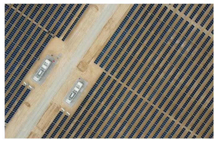
Mohammed bin Rashid Al Maktoum Solar Park in Dubai.