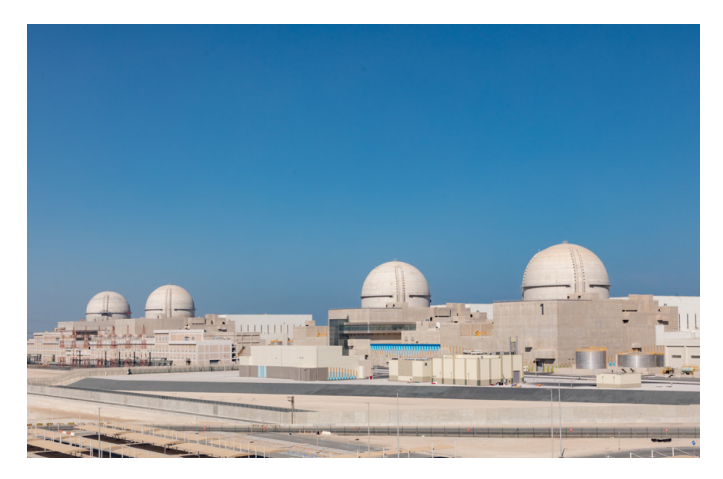
The Barakah Nuclear Energy Plant is currently delivering 2,800 megawatts of clean and reliable electricity to the UAE grid.

The UAE is also the first country in the Middle East to operate zero carbon nuclear power, which, along with renewable energy, will provide 14GW of clean power for the UAE by 2030.