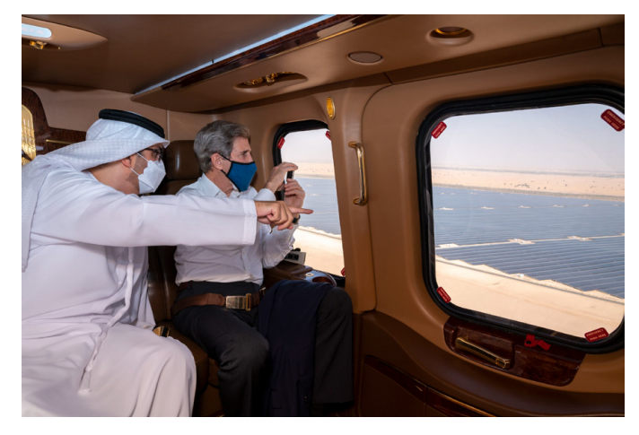
Climate Envoy Kerry visited major strategic projects in the UAE supporting the country's efforts in the field of clean energy, including the Noor Abu Dhabi solar park.

The UAE and US governments are building on many years of strong bilateral ties to tackle global climate change challenges together. The countries' joint efforts will not only accelerate efforts to reach climate goals, but will also enhance economic opportunity and diversification, while creating knowledge, skills and jobs.