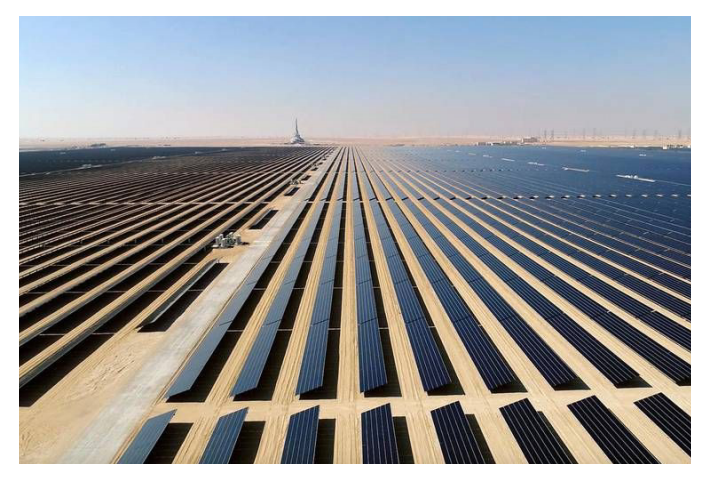
Mohammed bin Rashid Al Maktoum Solar Park in Dubai, the largest single-site solar park in the world based on an Independent Power Producer model.

In a region with extreme heat and scarce natural water and food resources, the UAE is taking aggressive action at home and with partners to meet the global climate challenge. As one of the world's largest energy suppliers and sovereign investors, the UAE is also leading on the energy transition by reducing the carbon impact of hydrocarbons, deploying sustainable and clean technologies, and investing in renewable energy ventures in island and developing nations.