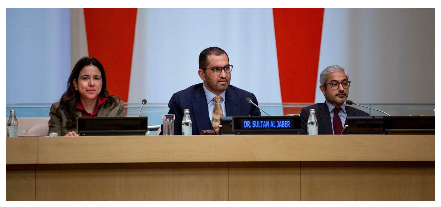
Addressing UNSC members, HE Dr. Sultan Al Jaber underscored the importance of climate finance to enable sustainable progress and stability.

Beyond its multilateral commitments, the UAE supports global sustainable development. The UAE has invested more than $50 billion in renewable energy projects across 70 countries – including 27 island nations – and plans to invest an additional $50 billion over the next decade. The UAE provides $1.5 billion of aid for renewables to more than 40 countries, with a special focus on island and least-developed nations.