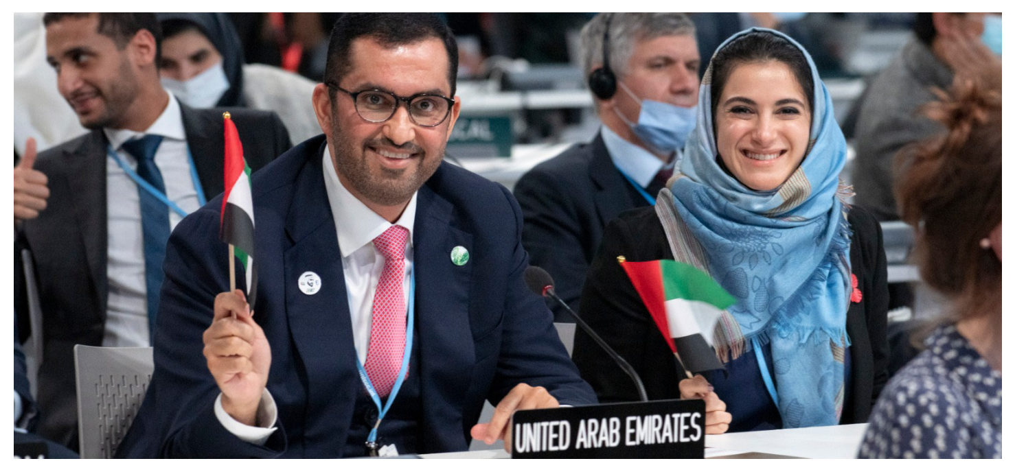
In November 2021, the UNFCCC announced that the UAE will host COP28 in 2023.

The climate emergency is a global challenge that requires a global response. The UAE looks forward to further strengthening cooperation with the US and partners around the world to drive climate action and chart a course for a more sustainable future.