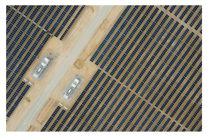
Mohammed bin Rashid Al Maktoum Solar Park in Dubai.