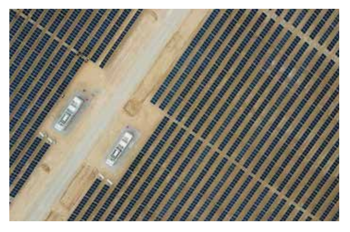
Mohammed bin Rashid Al Maktoum Solar Park in Dubai.