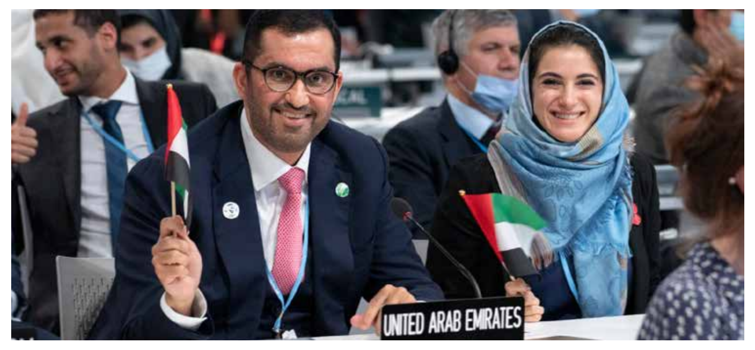
In November 2021, the UNFCCC announced that the UAE will host COP28 in 2023.

The climate emergency is a global challenge that requires a global response. The UAE looks forward to further strengthening cooperation with the US and partners around the world to drive climate action and chart a course for a more sustainable future.