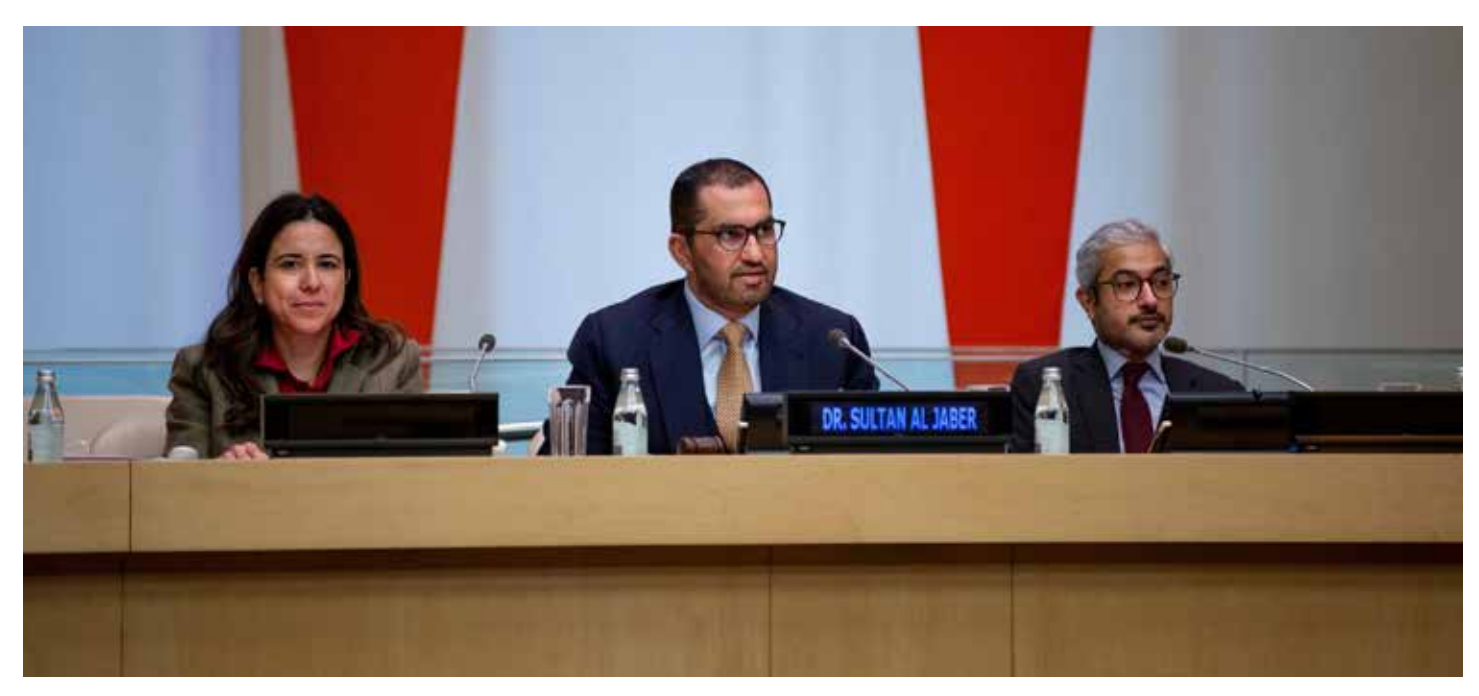
Addressing UNSC members, HE Dr. Sultan Al Jaber underscored the importance of climate finance to enable sustainable progress and stability.

Beyond its multilateral commitments, the UAE supports global sustainable development. The UAE has invested more than $50 billion in renewable energy projects across 70 countries – including 27 island nations – and plans to invest an additional $50 billion over the next decade. The UAE provides $1.5 billion of aid for renewables to more than 40 countries, with a special focus on island and least-developed nations.