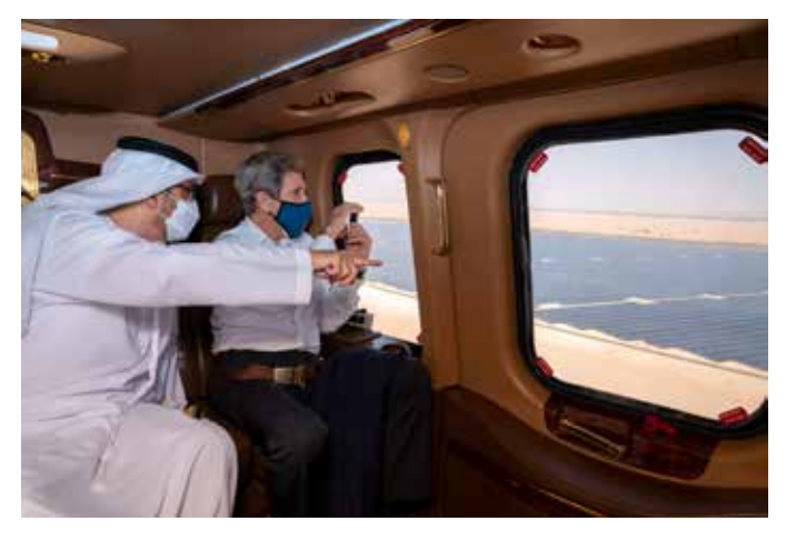
Climate Envoy Kerry visited major strategic projects in the UAE supporting the country's efforts in the field of clean energy, including the Noor Abu Dhabi solar park.

The UAE and US governments are building on many years of strong bilateral ties to tackle global climate change challenges together. The countries' joint efforts will not only accelerate progress toward climate goals, but will also enhance economic opportunity and diversification, while creating knowledge, skills and jobs.