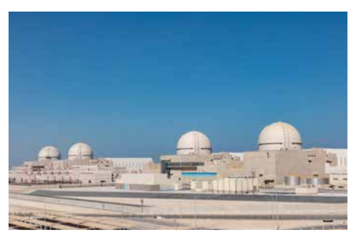
The Barakah Nuclear Energy Plant is currently delivering 4,200 MW megawatts of clean and reliable electricity to the UAE grid 24/7.

The UAE is also the first country in the Middle East to operate zero carbon nuclear power, which, along with renewable energy, will provide 14GW of clean power for the UAE by 2030.