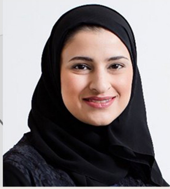
H.E. Sarah bint Yousef Al Amiri U.A.E. Minister of State for Advanced Technology