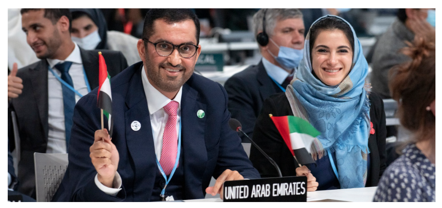
In November 2021, the UNFCCC announced that the UAE will host COP28 in 2023.

The climate emergency is a global challenge that requires a global response. The UAE looks forward to further strengthening cooperation with the US and partners around the world to drive climate action and chart a course for a more sustainable future.