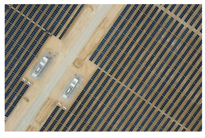
Mohammed bin Rashid Al Maktoum Solar Park in Dubai.